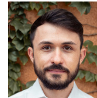
DR. WILLIAM DE SOUZA COLLEGE OF MEDICINE Department of Microbiology, Immunology and Molecular Genetics